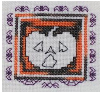
Model by Terry Allison Colors: WDW “Jack O Lantern” DMC 310, 550

Credit for the spider dangling from the bottom goes to my daughter. Two pumpkinheads are better than one!