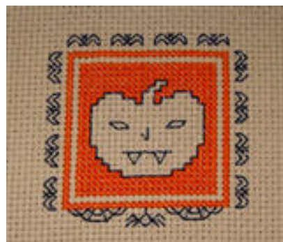
Model by Claire (RedStormCA) Colors: Kreinik #4 026 Generic orange craft floss

See next page for more models and faces!