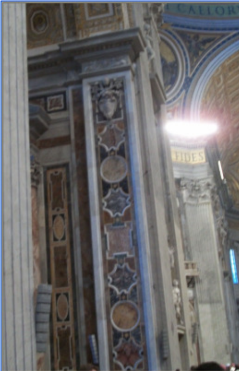
(column from San Pietro in Vaticano)

Model colors (Small) Cross stitch: Waterlilies "Garden Path": Backstitching (border/outline) – PTB PB50 Blackwork fill: PTB PB66